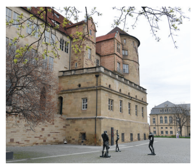
The Stauffenberg Memorial with its new exhibition is housed in the archival section of the Altes Schloss (Old Castle) in Stuttgart.

The exhibition also illustrates how Stauffenberg as a person, and the assassination attempt, have been interpreted quite differently at different times, by different groups, and in a number of countries, in the past and up to the present. Interactive media stations make it possible to actively experience the content of the exhibition.