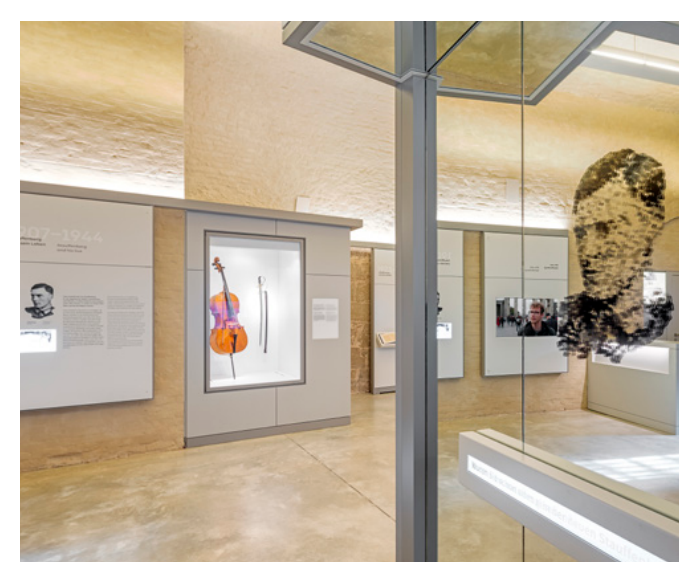
The exhibition shows some of the few existing objects that belonged to Claus Schenk Graf von Stauffenberg.