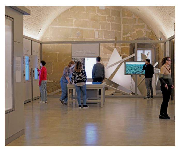
The House of History Baden-Württemberg reopened the museum with a new exhibition in 2022.